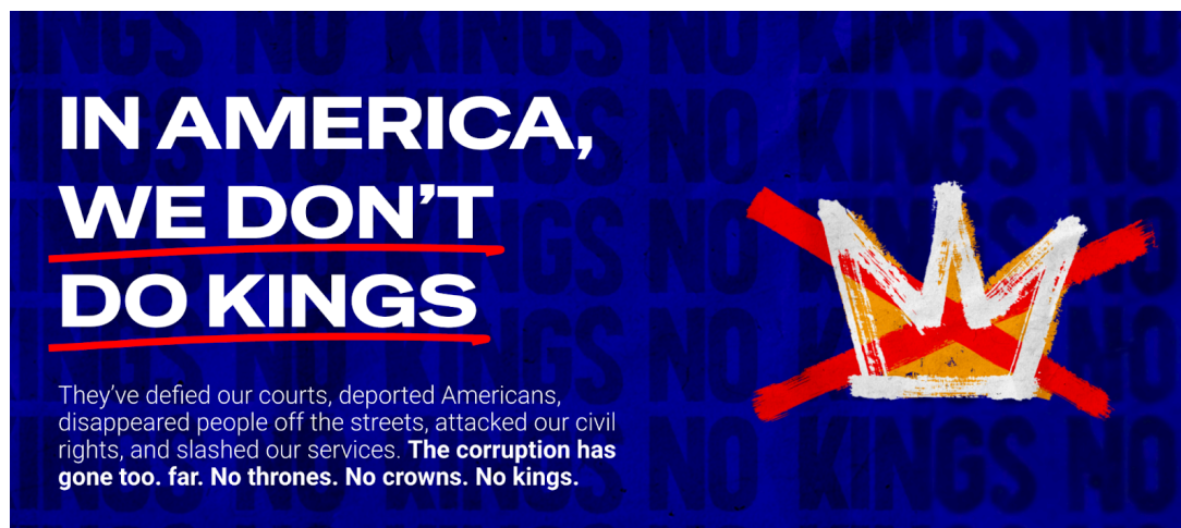
No Kings website homepage